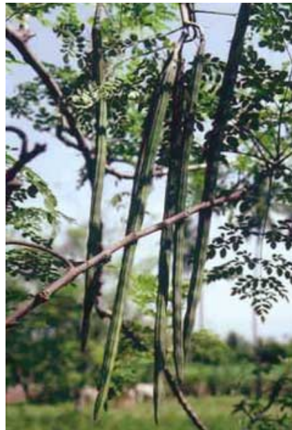
A. de Saint-Sauveur

Bacteria and viruses can attach themselves to the suspended particles in water that cause turbidity. Therefore, reducing turbidity levels through coagulation may also improve the microbiological quality of water.