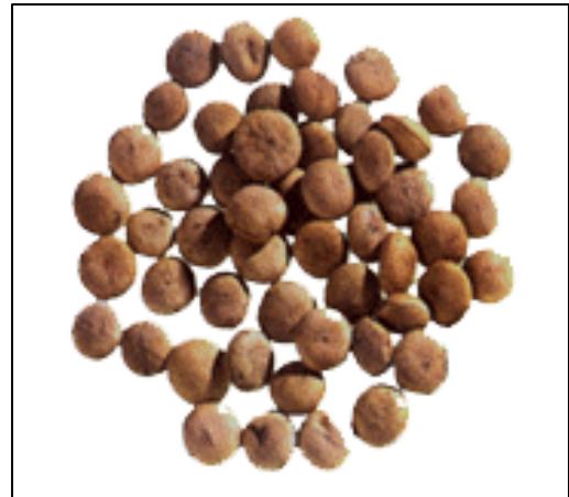
Dried clearing nuts