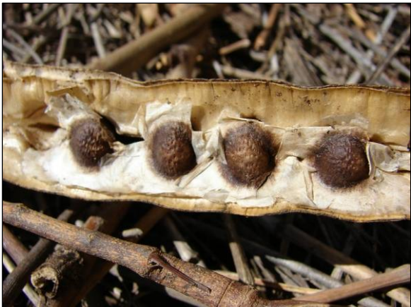
Moringa seeds in a pod

Users add the prepared dose of coagulant to the water. The water is then stirred for a few minutes to help create flocs. The flocs can be settled out and the clear water is decanted, or removed by filtration.