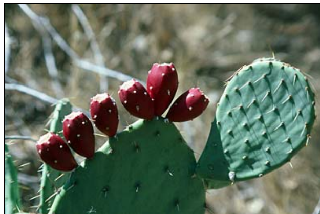
Prickly pear cactus